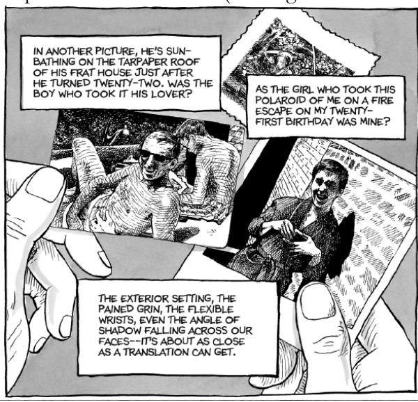
Figure 4: Excerpt from Fun Home, page 120.

Throughout Fun Home, evident stylistic choices are used to enhance the storytelling, and consequently the therapeutic, process. For instance, Bechdel uses multiple drawings styles as narrative elements, contrasting realistic reproductions of photographs with more cartoon-like images of her past. This provides a juxtaposition of actual history with her subjective interpretation of her memories (Watson 37). The subjective representations serve as Whitlock's autobiographical avatars, and thus Bechdel opens the door to exploration of her identity and experience on multiple levels (Fig. 4). Bechdel also utilizes the caption box to provide a voice for her detached narration of events, what therapists would label as a form of externalization: a separation from the problems of self, which allows for interaction with said problems and, consequently, the increased expression of emotions and a sense of empowerment over them (Keeling and Bermudez 405).