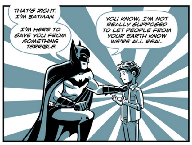
Figure 5: Excerpt from Something Terrible.