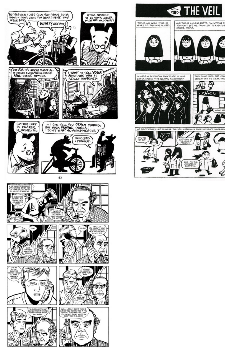
Figures 1-3: The varying styles of Art Spiegelman, Marjane Satrapi, and Harvey Pekar.

framework of this type of psychotherapy. Comics may even prove less daunting to a patient than painting or sculpture or drawing without words to support the images, because essentially, all a patient needs to create sequential art is a story: if a patient has a tale to tell—and every patient does (Sanders)—he can tell it through comics.